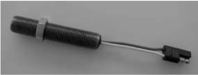
Magnetic Speed Sensor with Plug Connector

Quick information: Thread size : 5/8-18 UNF 2A Material : Aluminium galvanized, nut stainless steel Useable treatlength : 70 mm Pickup length : 79 mm Cable length without plug : 64 mm Complete length : 162 mm Plug connection : Automotive connection Identificationmark : On the magnetic side only: MSP 6721 Speed range : Up to 7500 Hz continuous