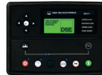
DSE871X Standard Remote Display Module