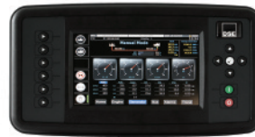
DSE8721 Colour Remote Display Module